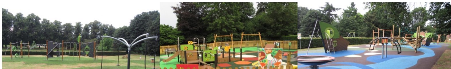
Rothamsted Park's impressive new three-section children's play area, funded by Harpenden Town Council, caters for different age groups.

Meanwhile Harpenden and the new mayor face a busy year ahead as Coronavirus constraints are hopefully lifted. A packed programme of HTC-supported local events is scheduled. We can look forward to the return in September of what were formerly three Summer (but now rescheduled) favourites: the Highland Gathering; Art on the Common; and the Classic Car Show.