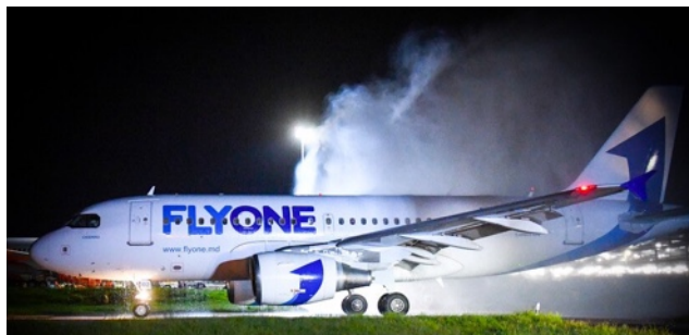
EasyJet and now Moldovan Airline FlyOne are both based at Luton

Not surprisingly, in view of its primary noise-reduction remit, LADACAN has also focussed attention on an updated Environmental Impact Assessment which directly contradicts an earlier assertion by the airport's cheerleaders that the latest Airbus A321neo aircraft going into service with easyJet and Wizz Air at Luton were quieter than the older types.